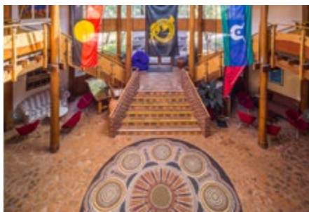
Centre for Aboriginal Studies at Curtin University

AGW would like to acknowledge the Indigenous Australians as the traditional custodians of the land and pay respects to their Elders past, present and emerging. We pass on our thanks for their custodianship of the land, water, and air through which we travel. During Naidoc Week – July 2024, we acknowledge that it is a time for all Australians to understand our shared histories, and to reflect how we can contribute to achieving reconciliation.