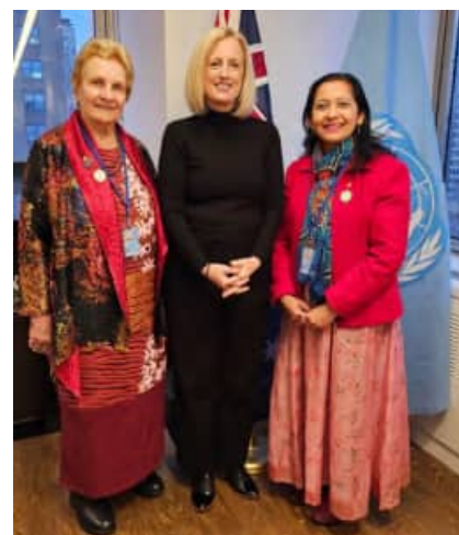
Jaya and Shirley with Hon. Senator Katy Gallagher, Minister for Women

We had the chance to meet with and speak to our Federal Minister for Women, Katy Gallagher, who led the Australian delegation and presented Australia's statement.