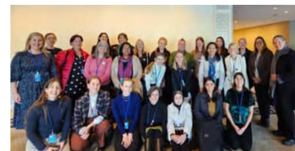
With members of the Australian delegation