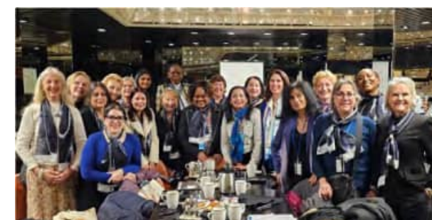
With members of the GWI delegation